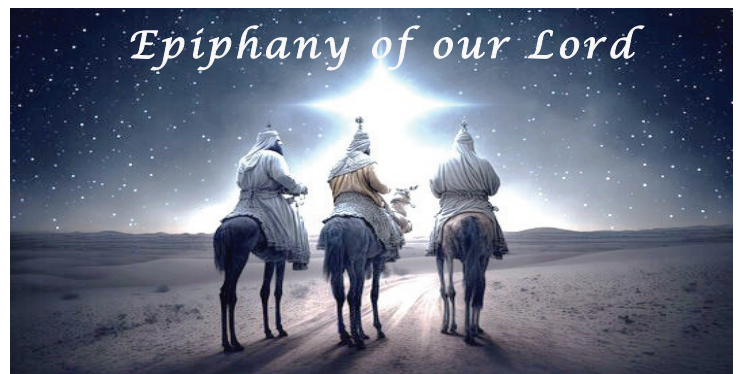
Epiphany of our Lord